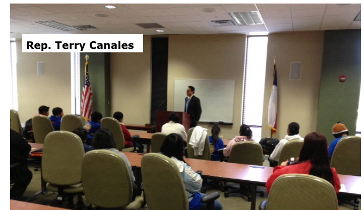
Rep. Terry Canales