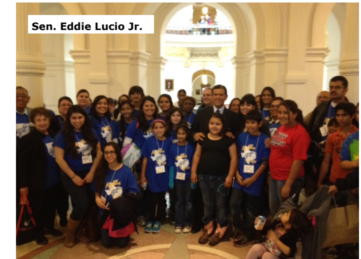
Sen. Eddie Lucio Jr.