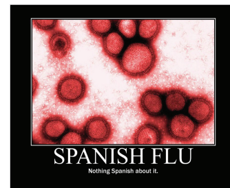
After learning about the Spanish Flu, students find a photo of the virus and develop their own posters

them in the right way because they are still curious and really want to learn." Students usually enter school as a question mark and graduate as a period. When they are young, they are excited about learning. "Make the most of every minute," she advises.