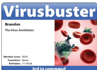
To find out more about this website, visit: bighugelabs.com